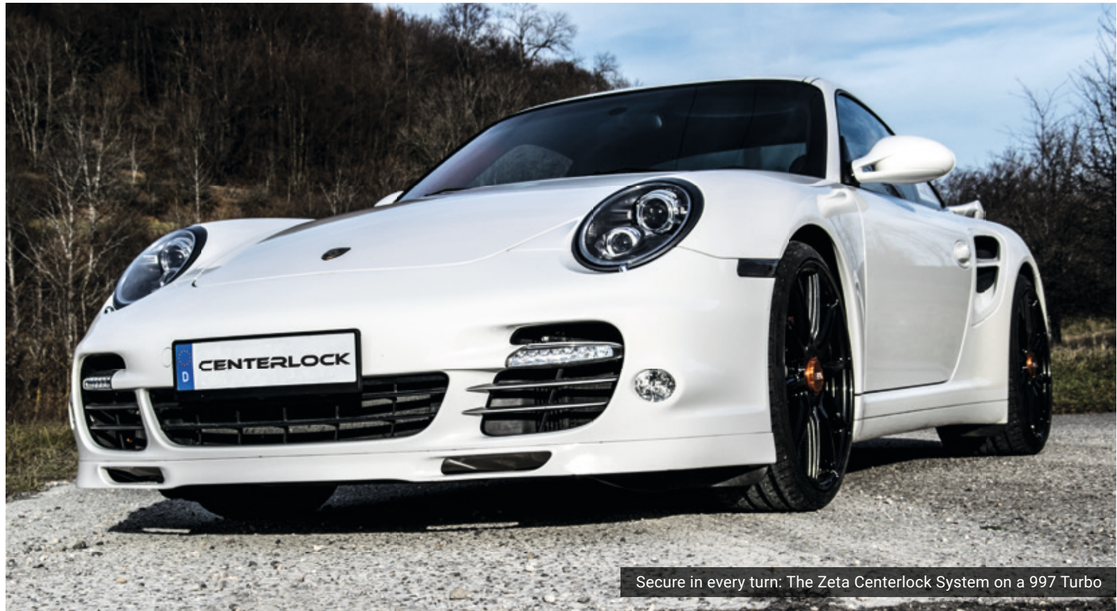
Secure in every turn: The Zeta Centerlock System on a 997 Turbo